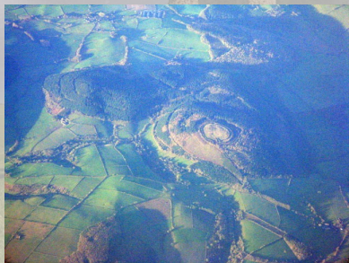
Bury Ditches, Shropshire