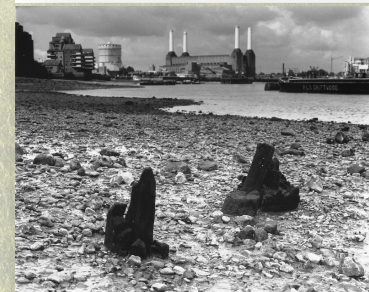
Vauxhall Timbers, London