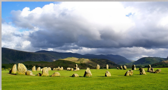
Castlerigg Stone Circle, Cumbria