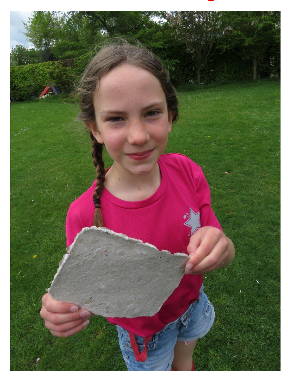
9. You can also experiment by adding petals, seeds or threads.